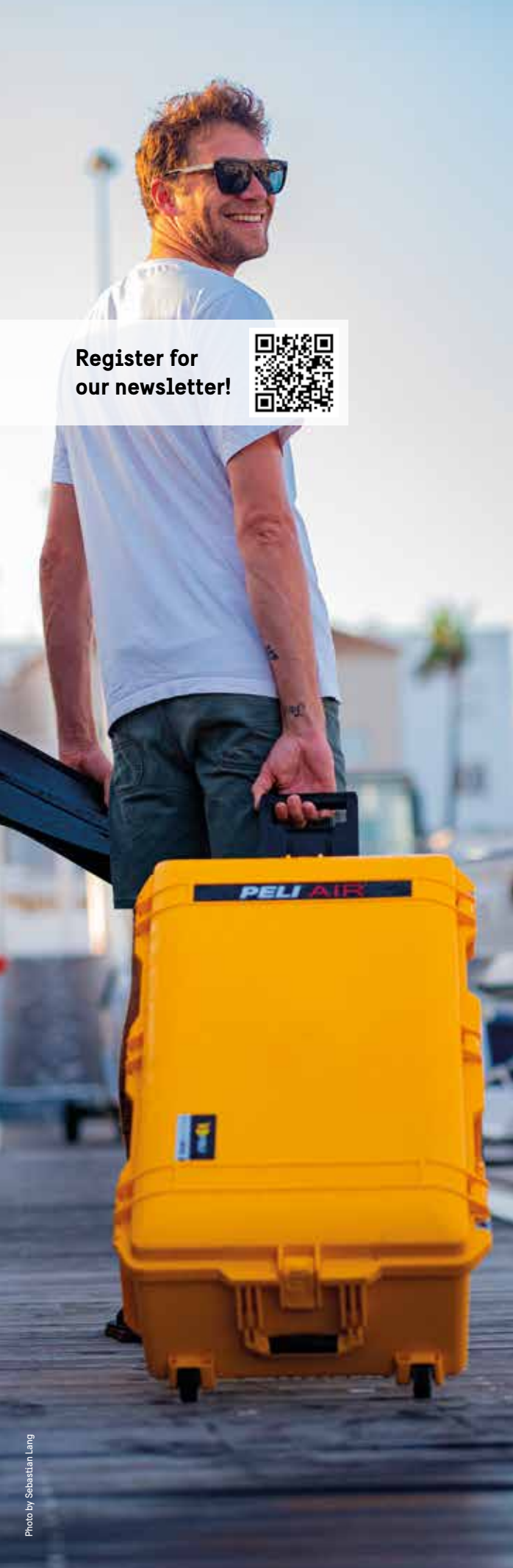
TABLE + OF CONTENTS